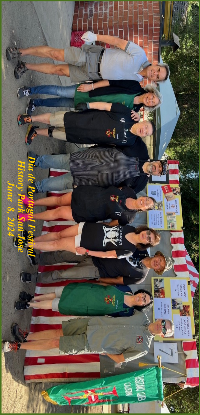
Dia de Portugal Festival History Park San Jose June 8, 2024

Be Green! Sign up for the Lusitano e-Bulletin