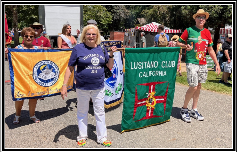
Lusitano's annual participation since 1997 at the 27th Annual Dia de Portugal Festival History Park San Jose - June 8, 2024