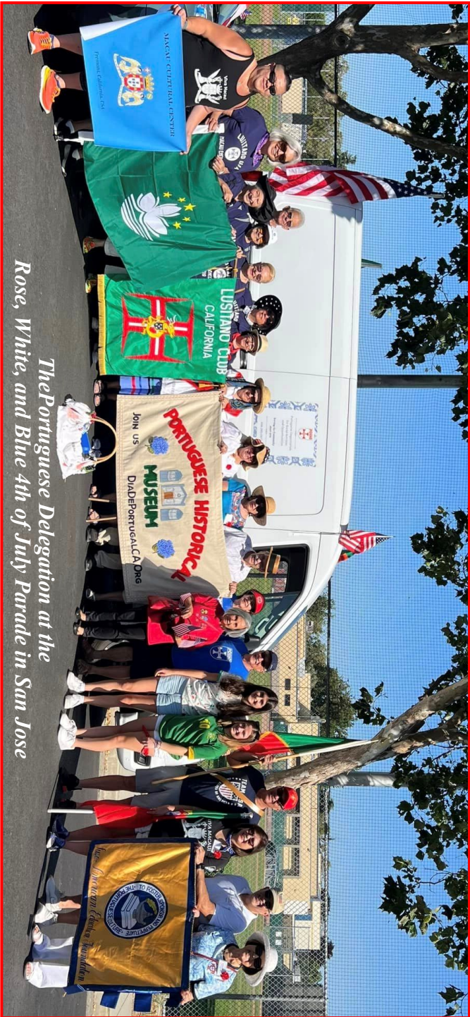
The Portuguese Delegation at the Rose, White, and Blue 4th of July Parade in San Jose

Be Green! Sign up for the Lusitano e-Bulletin