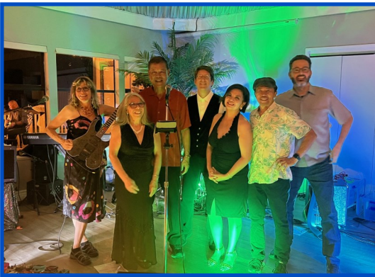
The Band: Airwaves